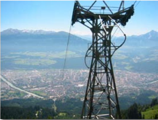
View to Innsbruck